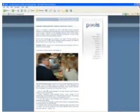
A screen dump from the new webportal www.languages.dk

The pools project was officially started on October 1 st