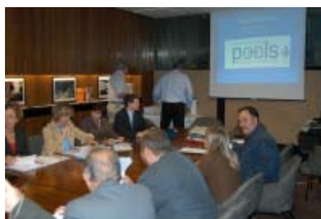
The full pools partnership met for the first time on October 12th for a kick-off workshop in Brussels.

Pools also wants to make use of a project "blog". A blog is a contraction of the word weblog. You can follow our blog at the address: www.weblogs.uhi.ac.uk/pools/