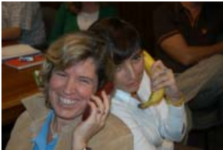
Don't worry - we have not gone bananas, The photo shows two Basque project members practicing a scenario during the kick-off workshop