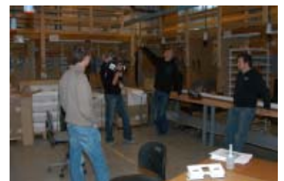
The first test videos for the materials pools are being produced at Odense Tekniske Skole, Denmark. The pools partners will produce copyleft video materials in nine languages.