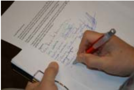
The pools members signed the copyleft manifest in Brussels

Latest News: Pools a new Leonardo II project has started with a kick-off workshop in Brussels and has been disseminated in Krakow (EuroCall 2005) and in Budapest (EfVET 2005)