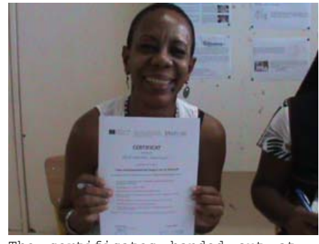
The certificates handed out at the end of a Methods course in Guadeloupe

The teams are now also preparing for the final meeting in Guadeloupe. Part of this planning took place in Malta during the project meeting, where the contents of a final conference in Morne à l'Eau were discussed. The consortium agreed that the aim to run workshops for teachers on the island, as well as individuals from the tourism industry would be an asset. The meeting in Malta was held at MCAST, who took very good care of their guests for the weeklong meeting. During the meeting the teams tried out their techniques for running courses with a handful of participants from MCAST teaching staff, giving the teams the chance to learn from each other, give advice and get inspiration for their own courses.