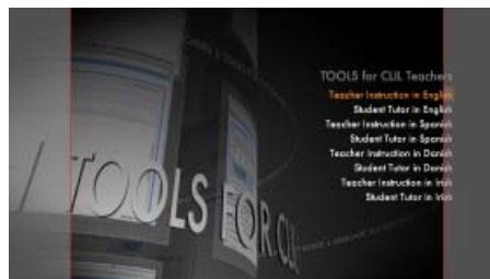
Screen capture of one of the two DVDs produced by the TOOLS teams

The Irish and Scottish teams have decided to make the videos in their own languages thus adding two more languages to the videos than we had planned for in the original application:-)