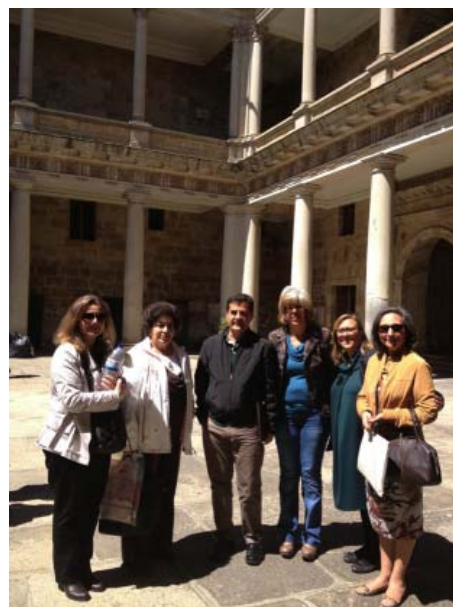
Portuguese Language Teachers at University of Salamanca

Portuguese as a Foreign Language has been steadily growing in these few past years. There is a growing community interested in the learning of Portuguese. Several units were demonstrated, showing the features of Clilstore, such as the possibility of creating media rich webpages for the purpose of language learning with the possibility of linking every word in the text to online dictionaries.