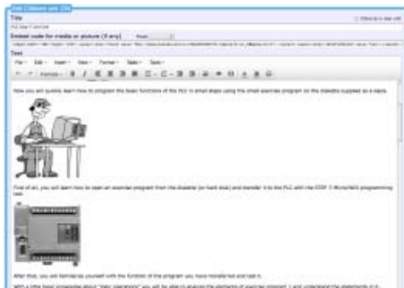
The Clilstore editor now features WYSIWYG

One of the comments from the EACEA evaluator was that we should consider not putting everything into the archive, in particular the confidential part of the Progress Report, it may or may not be wise doing so, but it has been our policy from the very beginning to have full transparency in the project. This was also described in the original application (which can be downloaded from the archive;-)