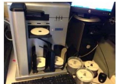
The machine producing the 2,000 DVDs with print.

You can get the project DVDs by mailing ka@sde.dk . We have made 2,000 copies and as long as we have DVDs left we mail them for free. All you have to do is write which of the DVDs you want; the one with videos in Danish, English, Portuguese, and Spanish or the one in English, Irish, Lithuanian, and Scottish Gaelic. Both DVDs contain the videos for students and teachers.