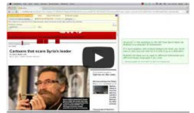
The student tutor video demonstrating how students can make best use of facilities in the online units

The videos have been shared on Youtube and can now also be watched online from the project website www.languages.dk/tools/index.htm#Tools_videos