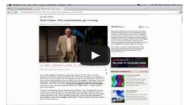
The teacher video demonstrating how to make online units in just a few minutes

You can get the project DVDs by mailing ka@sde.dk . We have made 2,000 copies and as long as we have DVDs left we mail them for free. All you have to do is write which of the DVDs you want; the one with videos in Danish, English, Portuguese, and Spanish or the one in English, Irish, Lithuanian, and Scottish Gaelic. Both DVDs contain the videos for students and teachers.