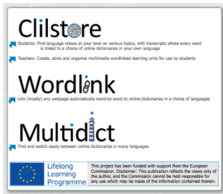
Part of the new Clilstore interface

The system has been functioning for more than a year now, and the project team has been testing it with various target groups in their own institutions as well as in numerous international conferences, workshops and other events.