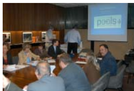
The full pools partnership met for the first time on October 12th for a kick-off workshop in Brussels.

All materials produced by pools are CopyLeft, which is a way to license a work so that unrestricted redistribution, copying and modification is permitted, provided that all copies and derivatives retain the exact same licensing.