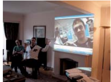
Dutch student feedback through a Youtube.com video