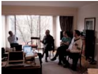
Activities during the POOLS-T workshop in Brussels