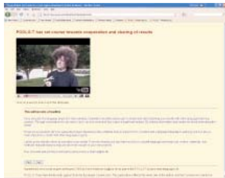
The POOLS-T desk top tool now supports YouTube videos

Main focus was of course the function of the two tools which the project will deliver. We experimented with Greek fonts and had a first success with exporting web pages from the desk top tool