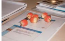
Activities during the POOLS-T workshop in Hoorn