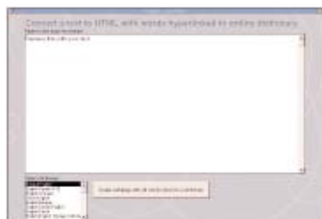
An experimental simple version suitable for students working with technical texts

with presentation of Greek letters, at least when we used ISO fonts. The final version of the tool will have support for Unicode fonts as those are the future and will also enable other non Latin fonts, e.g. Cyrillic and Arabic.