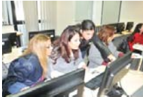
Different POOLS teams in action across Europe