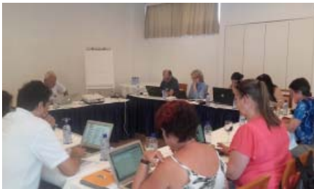
The Clil4U teams working through the 108 scenarios checking links

The Cy team cannot believe that the CLIL4U project is coming to the end. By the end of the month, our project will be officially over. However, the activities related to it are so strong and continuous that managed to establish the project not only as one of the most successful ones that Intercollege has taken part in, but as a long lasting one whose outcomes will benefit all of its users for many years in the future. In any case, each team has constructed a list of future-long term activities that will keep the project alive.