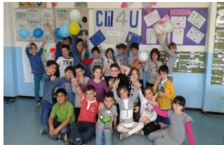
Children from the ICMG Bussero celebrating the CLIL results

the last meeting submitted to the Danish coordinator and finish all the final reports. The efforts, however, of the establishment of the CLIL method and the outcomes of CLIL4U will never stop and Intercollege will continue to make use of whatever the project has offered so far and will be offering still in the future. Well done everyone! Nobody would expect such a lovely consortium to work with; therefore, we would like to thank each and every one of you from the bottom of our hearts!