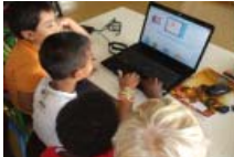
Clil4U in action across Europe