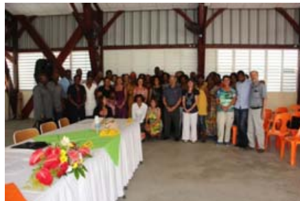
The Methods teams getting ready for the arrival of the conference participants

The EfVET team also disseminated the Pools-3 project by handing out more than 50 Newsletter and as well as leaflets to the participants.