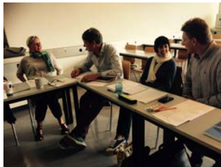
Students from a SUPSI CLIL course.

subtitles into Italian, filmed and edited 6 promotional videos. Outside the project, but related to it, the team has collaborated with colleagues from the SUPSI Marketing and Business studies Department, assisting them in the preparation of CLIL material for their classes. This collaboration will continue in the coming academic year.