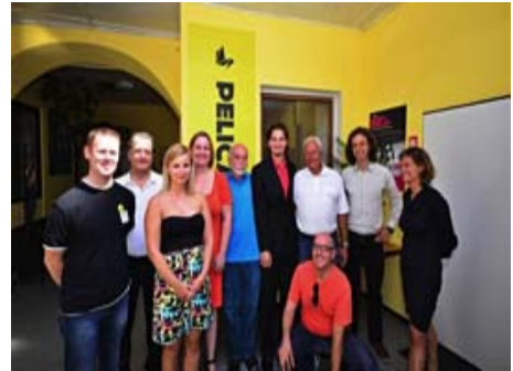
The Pools-3 partners during a workshop in Brno

Pelican, the Czech pools-3 partner reports that the impact of the project in the Czech Republic can be measured easily through the translated, localized, and tested project materials, 20 new videos for teaching of Czech as a foreign language, 3 workshops, 34 trainees and one cooperating vocational school. The participants from Pelican also very much appreciate the fact that the project outcomes enabled them to use the newly-gained knowledge to increase the quality of other ongoing projects such as VIDEOforALL.