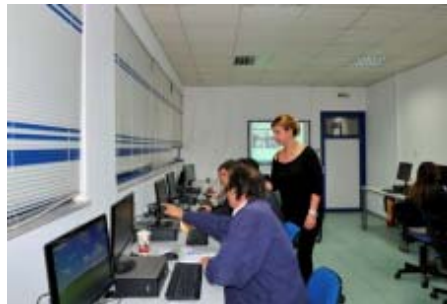
A Pools-cx teacher course in Larissa, Greece