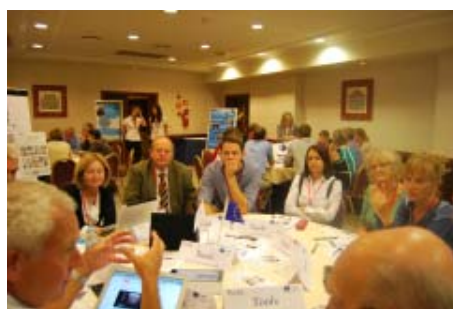
A roundtable presentation of the TOOLS outcomes and project during EfVET 2012

We hope in the near future to be able to offer a menu system where teachers can select units suitable for their students and present them in a shorter menu. Read the article on "Curation" in this newsletter.