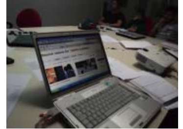
From a pools-cx course in Pistoia. Teachers preparing a unit for Clilstore

The TOOLS partners are very grateful for the valuable feedback we have received from the pools-cx partnership countries