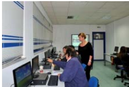
A Pools-cx teacher course in Larissa, Greece