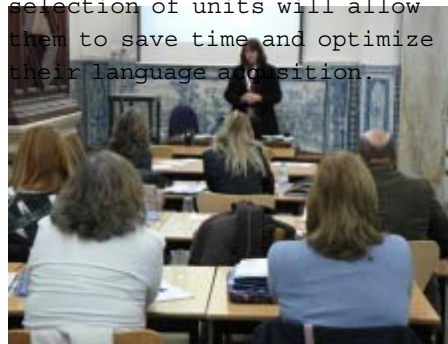
A TOOLS course on Clilstore in Evora, Portugal

CLILstore. Users can still select CLILstore units based on their own interests, levels and (probably) a certain amount of randomness. But for those users who are looking for quality and coherence without having to spend too much time looking through many units in CLILstore, using the curators' selection of units will allow them to save time and optimize their language acquisition.