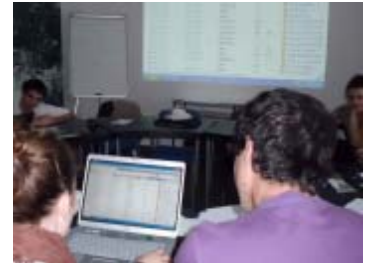
Clilstore in use in Pistoia during a course for Spanish teachers