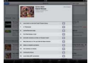
Audio podcasts on Island Voice

I padio audio clips can be used very flexibly. As we know already, you can embed them in a Clilstore unit. Or you can post the links in your Facebook or Twitter accounts. You can also make podcasts of them, and even place them in iTunes!