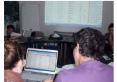
Clilstore in use in Pistoia during a course for Spanish teachers