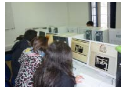
Erasmus students in Evora working with Clilstore and Hot Potatoes units

which took place at University of Évora, between the 6 th and the 7 th of December, the Portuguese team gave a small workshop to teachers interested in Clilstore ideas. Previous presentations had focused on the lack of materials that CLIL still endures. Teachers have to create their own material, and that is a hard and time-consuming task. When Clilstore was presented, reactions appeared. "That's a great tool!" Some suspicion was heard around the room: "Are you sure it's for free?" and "Can we really use those units that you are showing us?" The answer was YES for both questions. After demonstrating how easily anyone can create a unit, we finished our presentation challenging those teachers to try and use Clilstore in order to create their own materials. See for example: http://alturl.com/p74yf