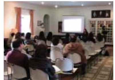
Course participants at the Portuguese as a foreign language course in Evora

A fter we finished the pools-2 project period we have been contacted by the Executive Training Institute (ETI) Malta who plan to align their TEL course to the POOLS-2 and POOLS-M courses. ETI would like to promote and contribute to the dissemination task of the programmes developed by POOLS and act as a training provider and facilitator offering in-service training which refers to the POOLS Project/Product addressing all teachers in the EU as well as those states participating in the EU LLP.