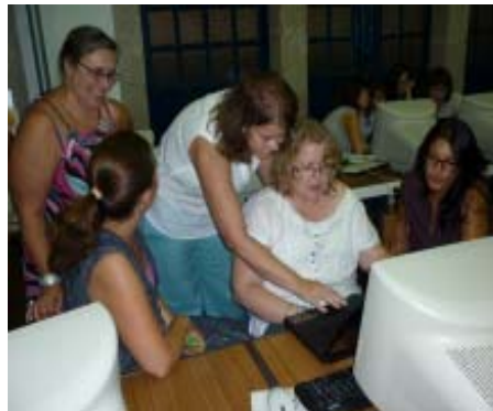
Portuguese teachers preparing ready to use online materials