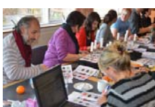
Pools members in action across Europe