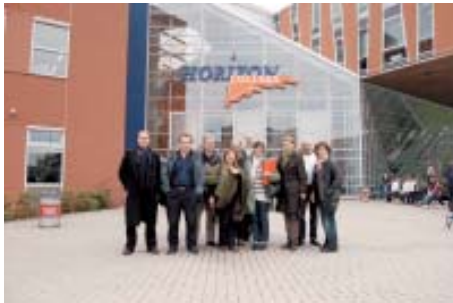
The team members grouping outside Horizon College after the final quality check

The final pools-t meeting and workshop took place at the Horizon College in Hoorn, the Netherlands. Representatives from all the teams participated in the workshop where we had a final check on the outcomes matched with the original application. It was a pleasure to verify that all deliveries were ready for use and indeed are being used on a world wide basis:-)