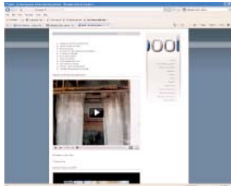
A view of the webpage with Portuguese videos

For each of the videos there will be a transcript and a translation into English to facilitate use of the material in e.g. blogs, Wordlink and the TextBlender.