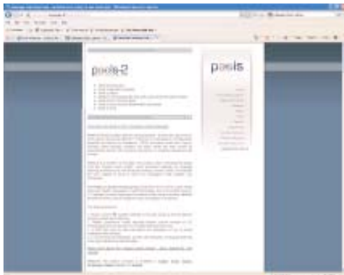
The dedicated pools-2 webpage

P ools-2 now has its own dedicated webpage www.languages.dk/pools-2 where all the outcomes will be presented. Of course the root of the website will continue to bring news about the project as well as the other sister projects pools-m and pools-t