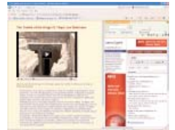
An exercises from Cyprus: The Tombs of the Kings

courses will be offered with modules from the pools-2 course guide. The course may be in-service courses, online courses, or blended courses. It is anticipated that most courses will be blended with an in-service start-up period matching a three days course followed by development of materials and exploiting theses in classes monitored and supported by the pools-2 course teachers.