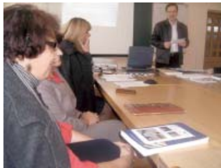
Pools-m brochures in action in Lithuania

Centre, there were almost all English language teachers from basic schools, gymnasiums, VET and Adult Education Centres. The teachers discussed about students' previous state exam results, activities and guidelines of methodology council for coming academic year.