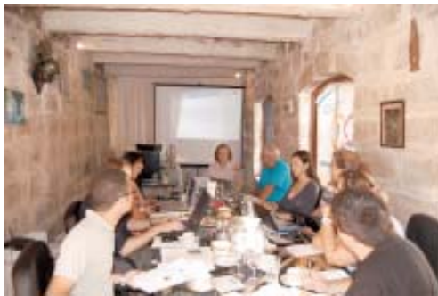
Pools-2 members from Cyprus, Denmark, Malta, Portugal, Spain, and Switzerland met in Sliema to prepare the future teacher courses

P ools-2 now has its own dedicated webpage www.languages.dk/pools-2 where all the outcomes will be presented. Of course the root of the website will continue to bring news about the project as well as the other sister projects pools-m and pools-t