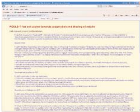
The textBlender now supports outputs with Greek characters

The TextBlender, which is the tool that can produce webpages with graphics, video, audio, and texts where all words are linked to online dictionaries, has undergone a major restructure process since the last newsletter. The new layout and function is based on feedback from the pilot teams in Switzerland, Greece and the Netherlands as well on assistance from the Scottish team.