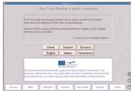
Entry screen in the TextBlender where the user selects the interface language

more languages thanks to other projects who make use of the tool, e.g. a Turkish partner in Pools-m has offered to translate the interface into Turkish.