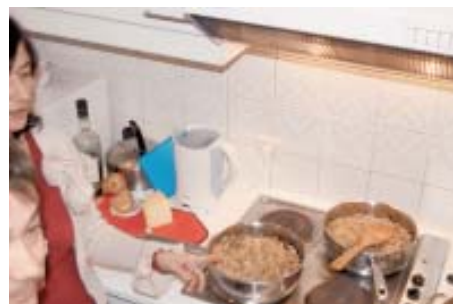
Finding the right recipe for a successful new project start

-Pools-t produce tools that automate / ease the production of eLearning materials.