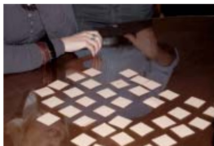
Overview of project pieces

A ll three projects under the pools umbrella (pools-t, pools-2, and pools-m) have been funded with support from the European Commission. This publication reflects the views only of the author, and the Commission cannot be held responsible for any use which may be made of the information contained therein.