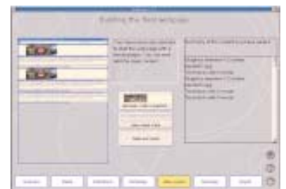
The "assembly" page

A new main improvement, we hope, is an assembly page where the author (that is you:-) can put together graphics, YouTube or Google videos, with or between blocks of texts. It is also possible to export a webpage linked to one dictionary and then return to the TextBlender and select a new dictionary so a class of mixed students can be served with individual pages and dictionary help.